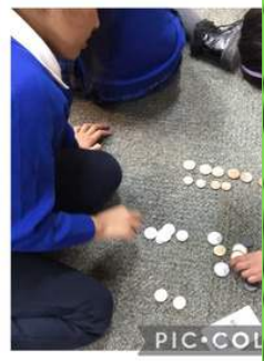
In Maths, the Year 2 children did role play to learn about comparing different amounts of money.