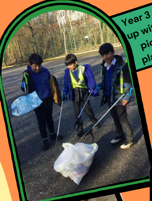
Year 3 cleaned up with a litter pick in the playground.