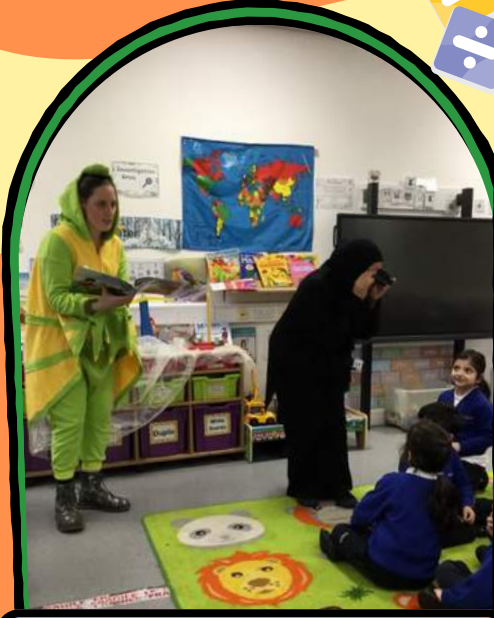
Reception have been learning all about dinosaurs, finding and cleaning fossils and even had a 'dinosaur' visit their class