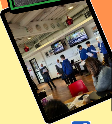
Year 6 pupils attended the launch of Manchester's Hate Crime Awareness Week and presented on Islamophobia.